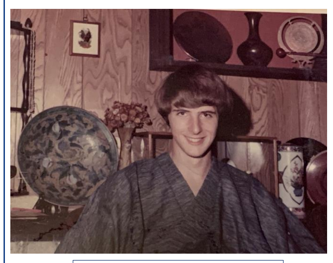
1967, 20 years old Exchange program in Japan

Q.What surprised you when you came to Japan? A.I thought it would be hot in May, but since it was the rainy season, it was cold and I only had summer clothes! I was also surprised at Japanese-style toilet. Also, the school rules were different. I didn't know that in Japanese high schools, students can't dye hair or drive. During my first year in this school, there was a student who dyed their hair. I told them that it looked nice. I got scolded! Even though I made a lot of mistakes, I came to love Japan and stay for almost 40 years.